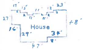
DETAIL of HOUSE 1" = 100'